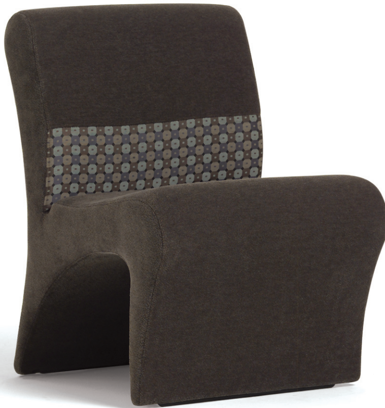
Loop Freestanding Seat Unit 1801