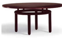
Coffee Table 18-1636