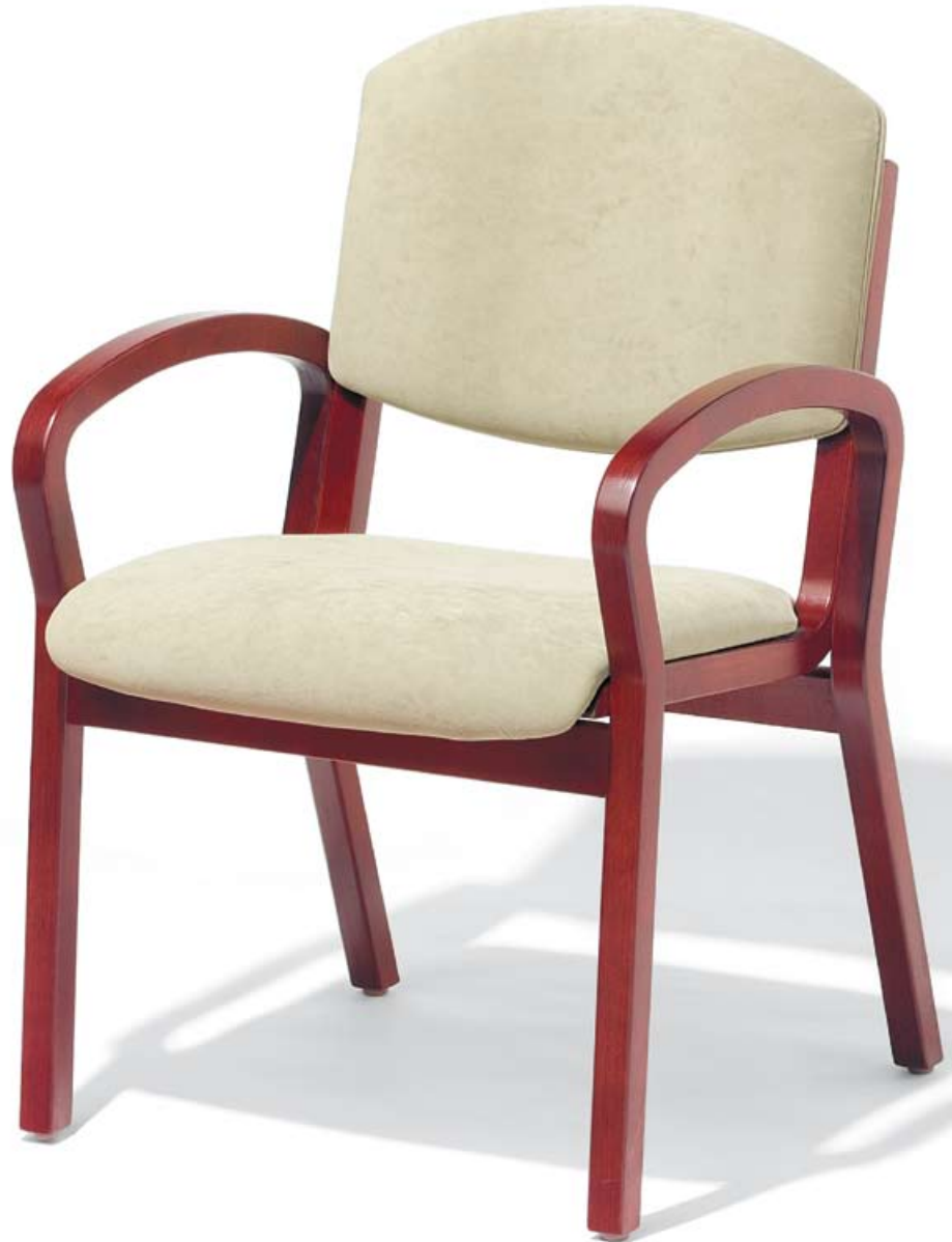
Model 732-4775 Shown with 36 Mahogany Finish Crypton Suede – Green Tea Fabric

Exhibiting a practical sophistication, the Horizon Arm Chair offers comfort and durability for a variety of seating applications in the education environment. Product features and benefits include: Full armrest support for enhanced comfort and an easy exit. ❖ “Waterfall” seat design using high-quality contoured foam. ❖ Plybent hardwood frame construction, with mortise and tenon joinery, ensures exceptional stability and durability. ❖ Removable cushions allow easy cleaning, repair, or replacement to further extend chair service life. ❖ A beautiful selection of 18 standard wood stains, with custom colors available. ❖ State-of-the-art, environmentally friendly 3-step finish process provides a more durable, longer lasting finish. ❖ Delivered pricing available. ❖ Our 10-year warranty – your assurance of quality and lasting value.