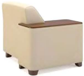
Chair with Table Arm 61211