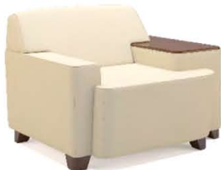
Chair with Table and Upholstered Arm 61311