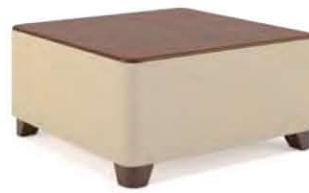
Table Ottoman 61-07