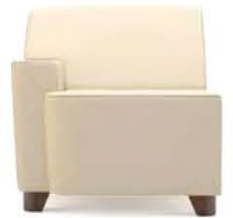
Chair with Upholstered Arm 61111