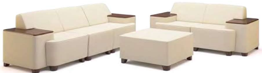
Puzzle Configuration 61310-3