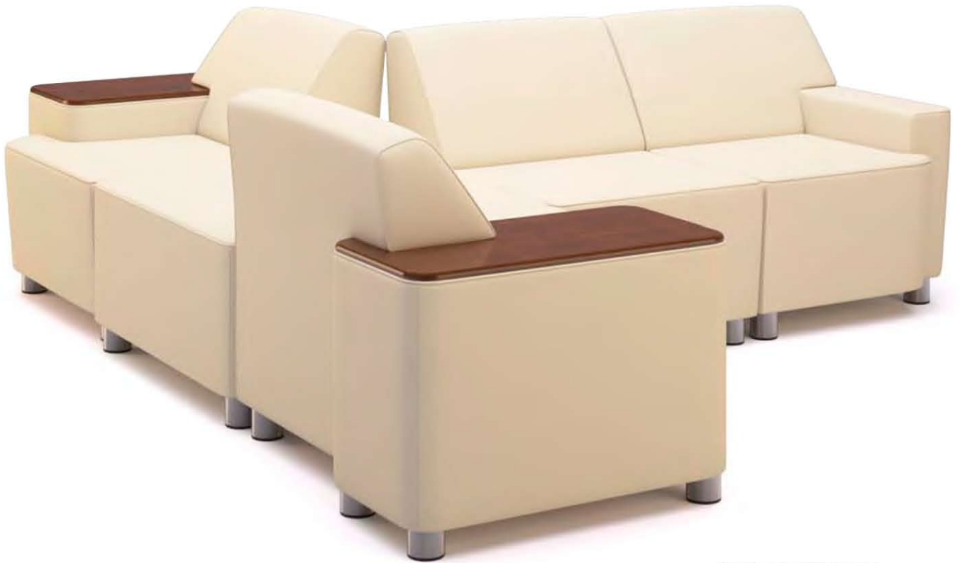
Puzzle Configuration 61310-1