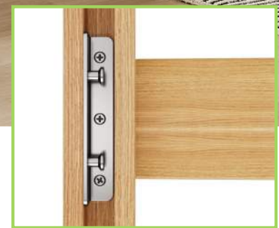
Open Track with Pin Plate