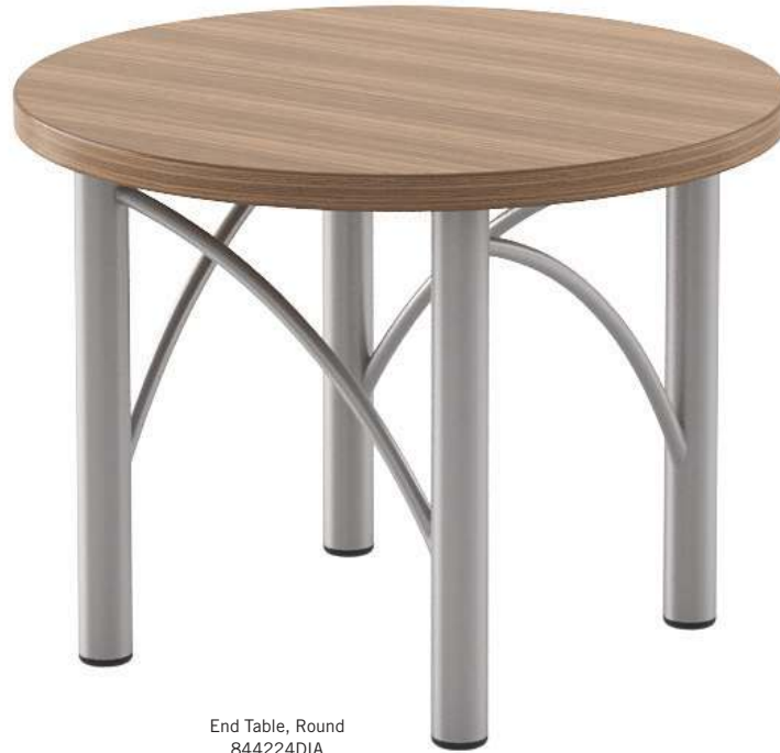
End Table, Round 844224DIA

The curved lines and mixed-material design of the 4200 Series occasional tables can complement seating designs for any modern lounge, lobby, or residence space.