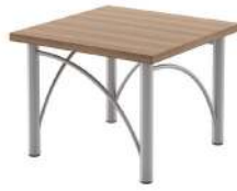
End Table, Square