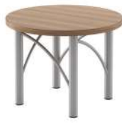
End Table, Round