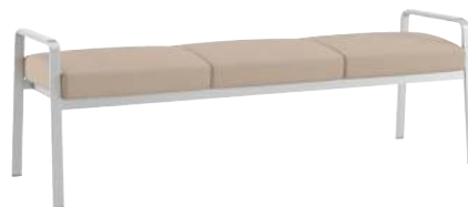
Hale 3-Seat Bench 665193