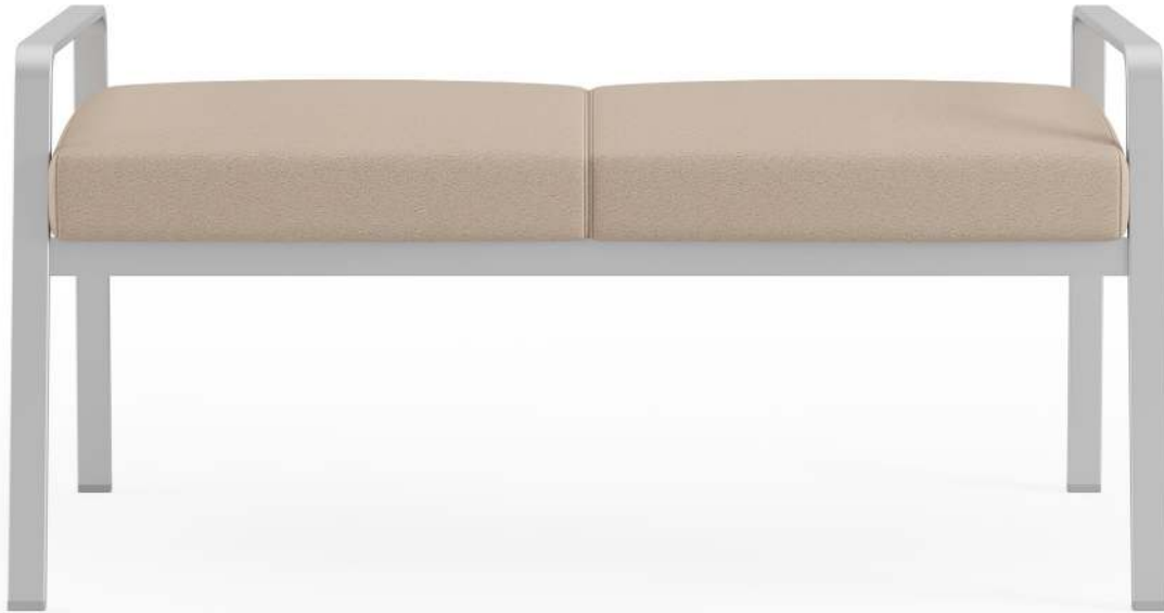
Hale 2-Seat Bench 665192

Hale Benches offer additional seating to any lounge space or corridor. Different lengths make them ideal for areas that are unable to accommodate large furniture.