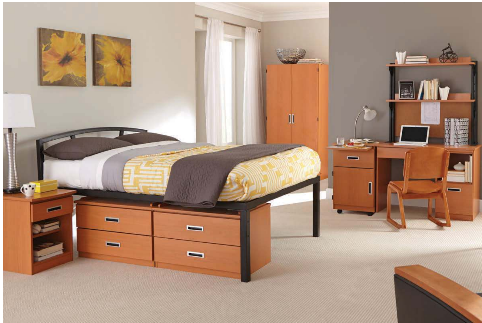
The Merit casegoods are a fresh, innovative line of student bedroom furniture featuring our, proprietary upscale laminate construction in multiple wood finishes and optional Graphite accent tops. Merit casegoods melamine laminate surface with PVC edge banding provide maximum durability and impact resistance.