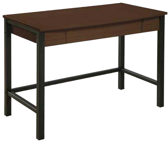
Merit Writing Desk