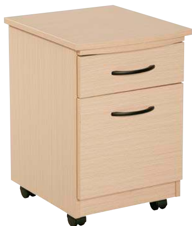
Merit Rolling Pedestal