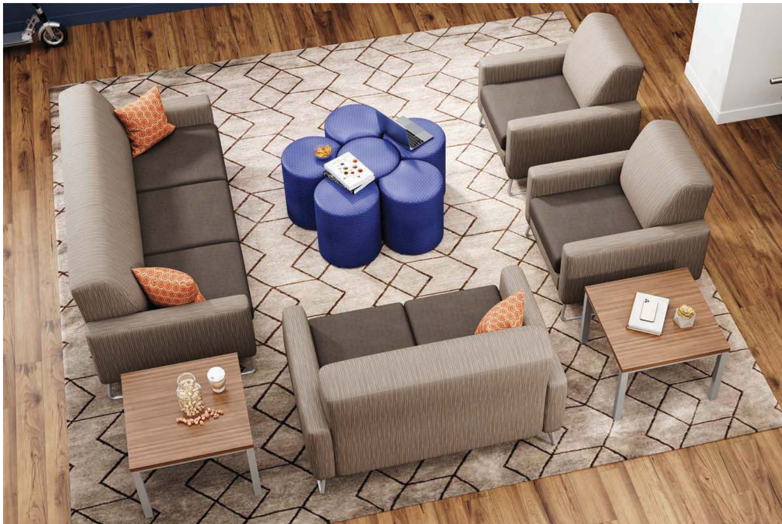
The Chill collection adds an element of comfort that will make students feel right at home in their suite or apartment. It has mid-century modern styling, and comfort that is comparable to residential furniture. Arms, cushions, and feet are all component replaceable for ease of style updates or repairs.