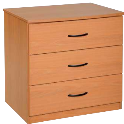
Merit 3-Drawer Bureau