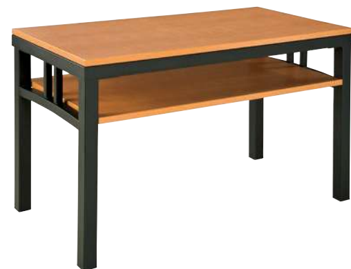
Rowan AV Console