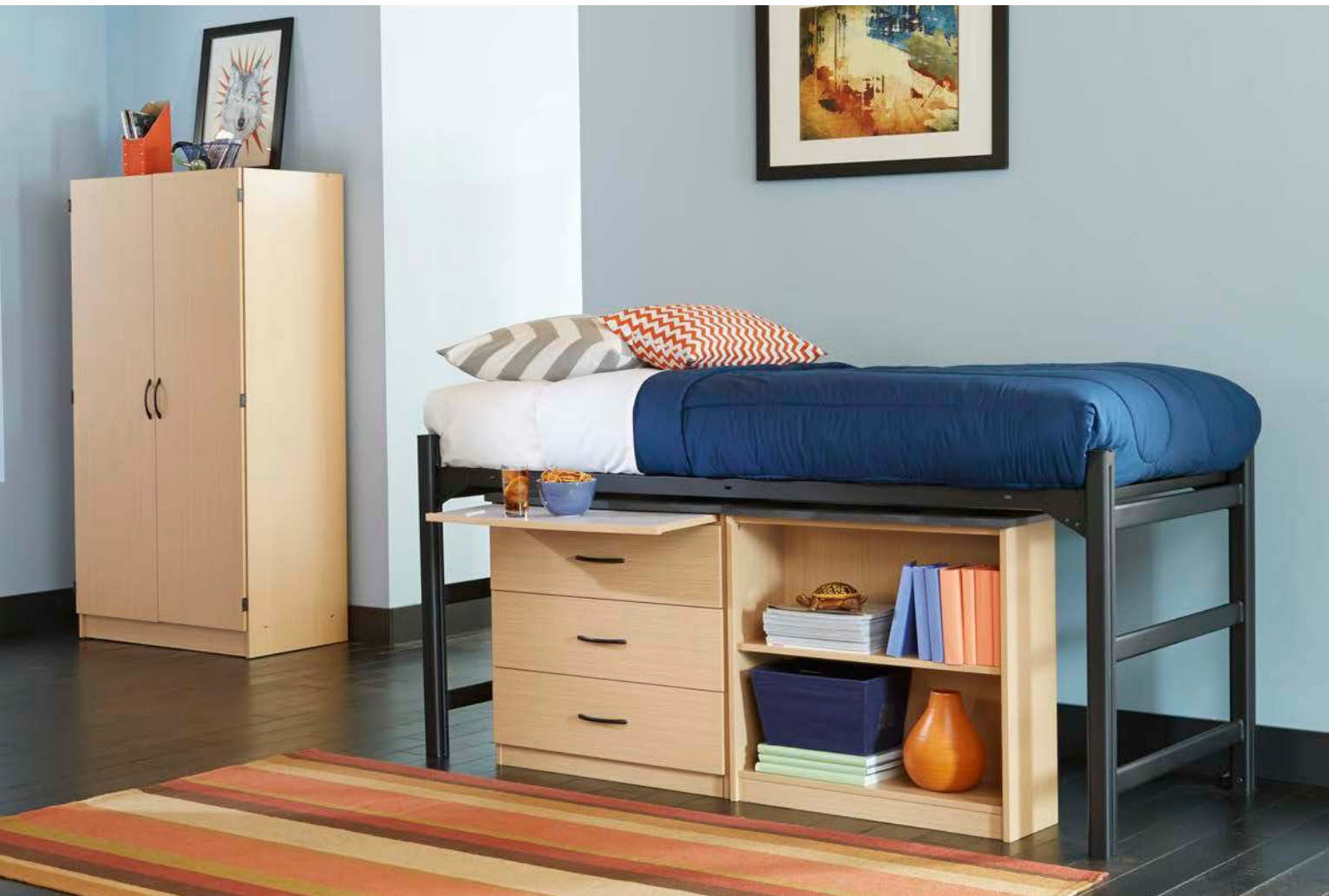
The Merit Collection is a fresh, innovative line of student bedroom furniture featuring our new, proprietary upscale laminate construction in three wood finishes and optional Graphite accent tops. Merit casegoods melamine laminate surface with PVC edge banding provides maximum durability and impact resistance.