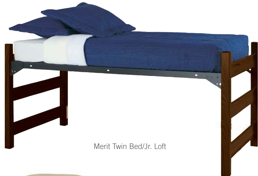
Merit Twin Bed/Jr. Loft