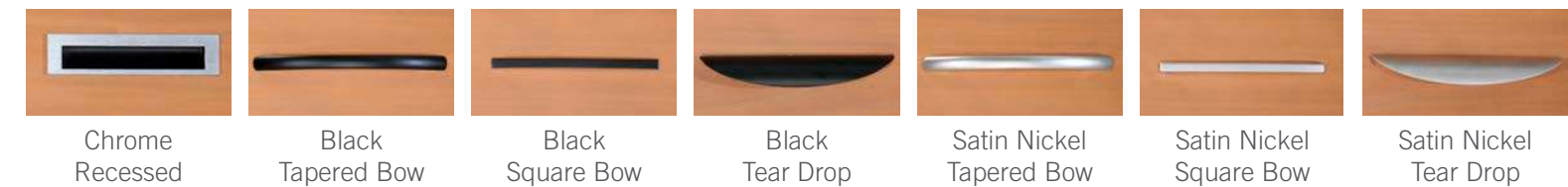
Chrome Recessed Black Tapered Bow Black Square Bow Black Tear Drop Satin Nickel Tapered Bow Satin Nickel Square Bow Satin Nickel Tear Drop