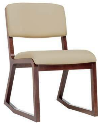
PlyLok 2-Position Chair