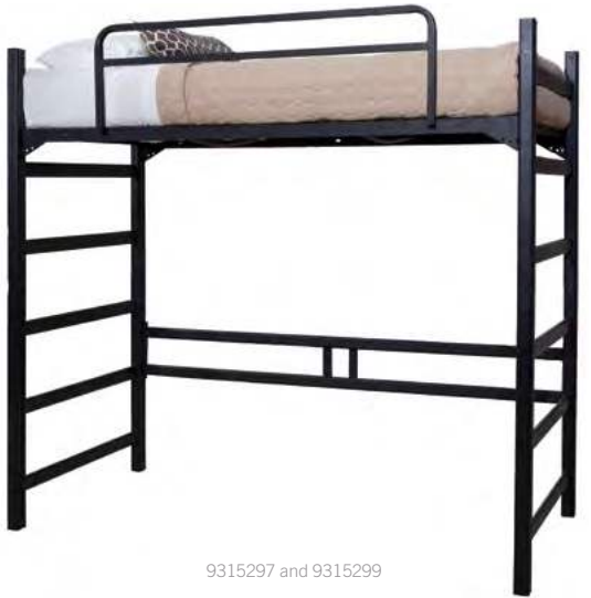
9315297 and 9315299

Accessories sold separately from bed system.