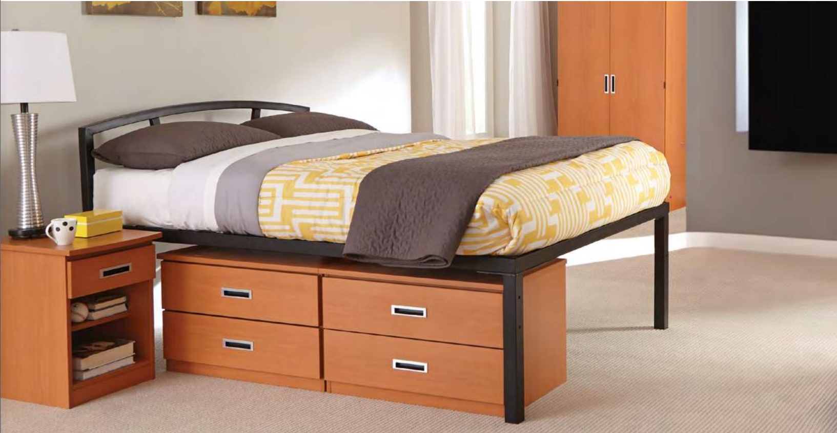
Raised Metal Full Bed 9616420 | Merit Nightstand 9835255 | Merit 2-Drawer Chests 9835211 | Merit Wardrobe 9845281