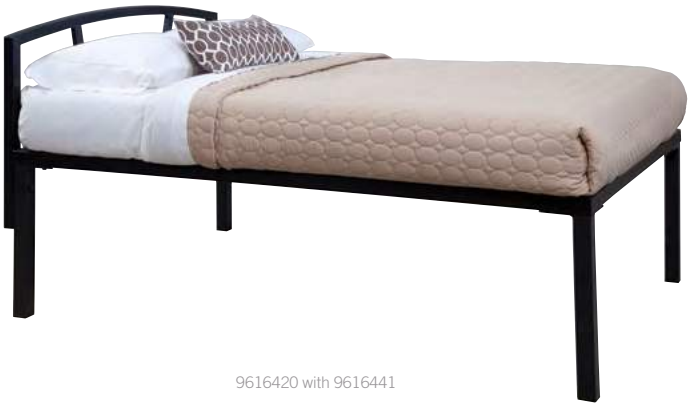
9616420 with 9616441