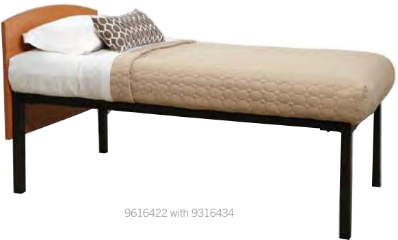
9616422 with 9316434

Accessories sold separately from bed system.