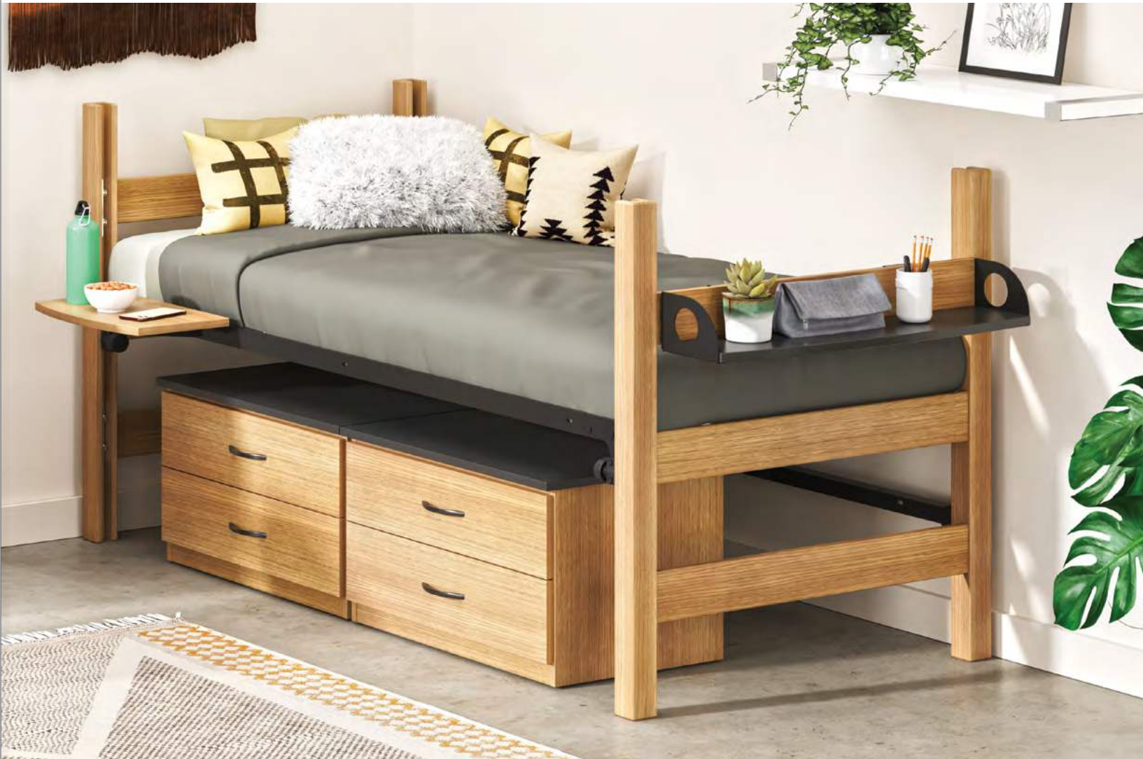
zTrak Jr Loft Twin XL w/zLok 9717008 | 2-Drawer Chest 9835211 | Side Table 9615522 | Rail-Mounted End Shelf, Single 9625520

zTrak with zLok knobs is a truly toolless system, and no disassembly is needed for height adjustment.